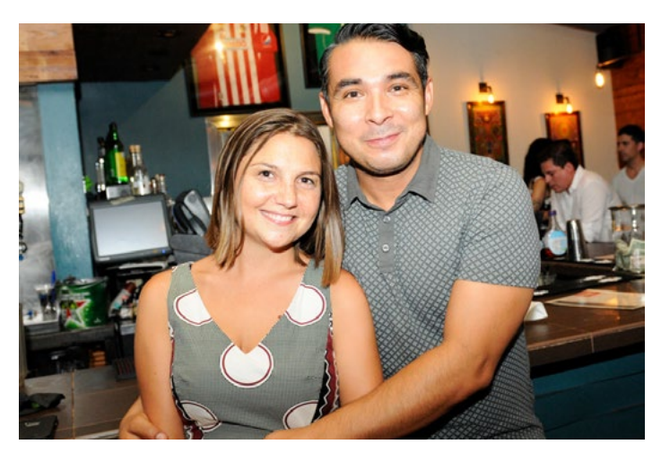
Attendees from Austin: 60+ Attendees from Sister City: 5